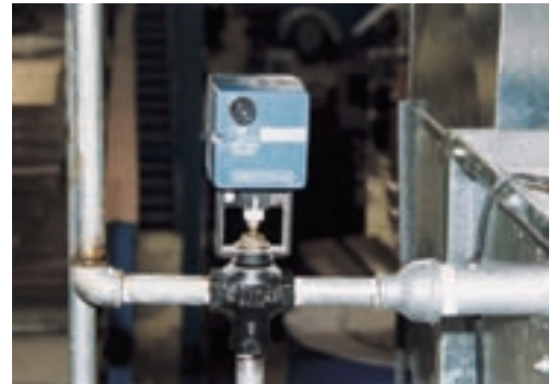
Three way valve